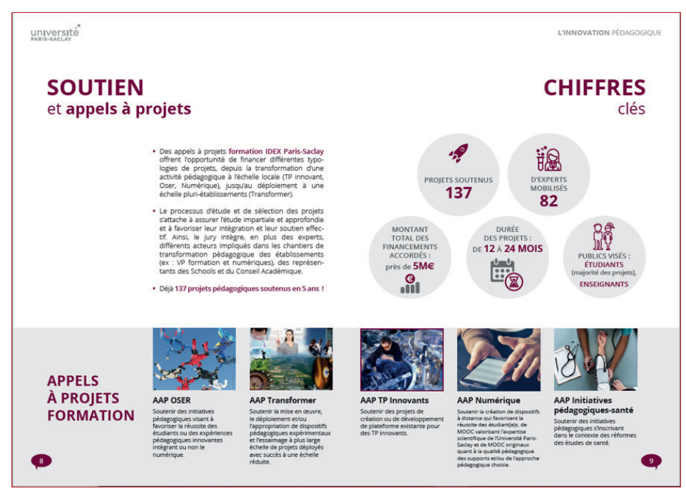
Figure 3: Extract from the booklet showing key figures on project support