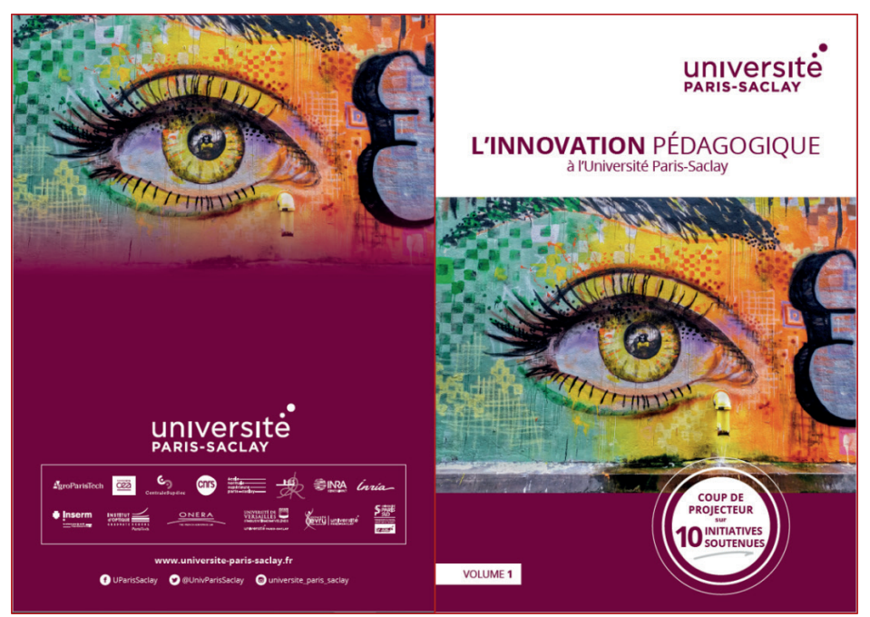
Figure 2: Cover of the booklet (first volume) promoting successful educational projects

These projects end with a report describing achievements and milestones. A feedback session is organized during the annual UPSaclay pedagogical day (JIP) to encourage spinoffs and the sharing of practices, as well as new initiatives. An external communication is also launched, with publication at the end of 2019 of the 1st volume of a series of booklets highlighting projects, and at the beginning of 2020 a posting on the UPSaclay website.